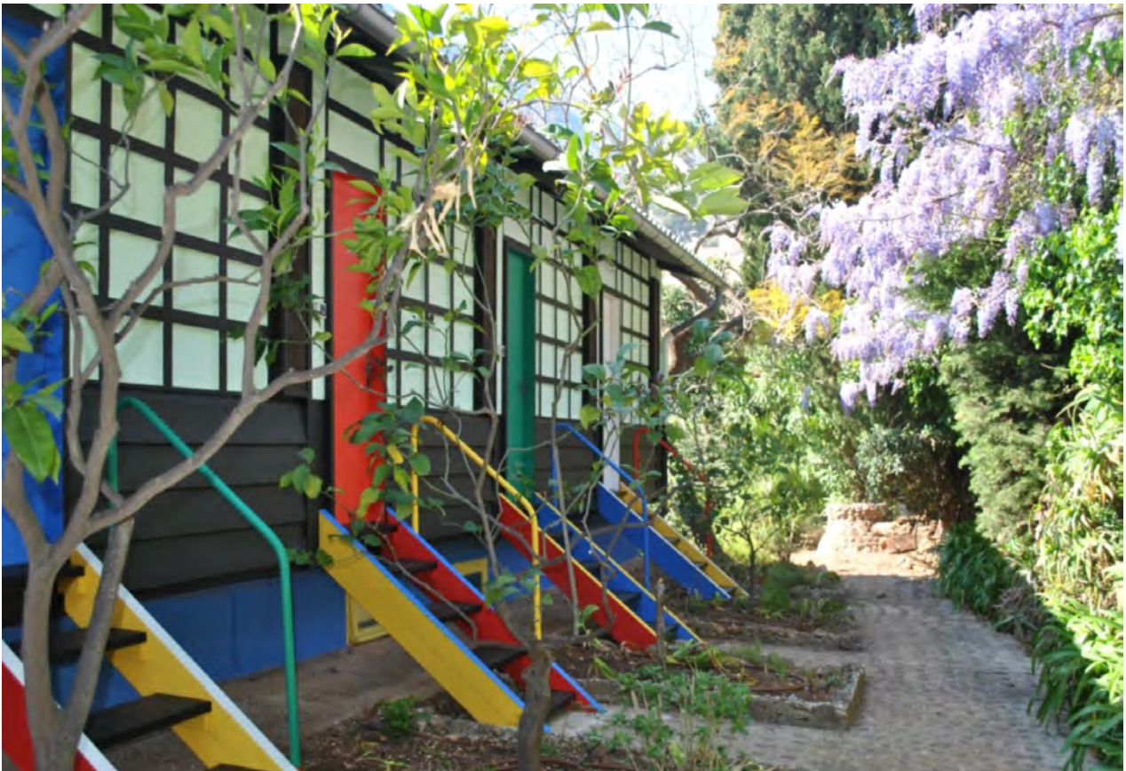
The Unités de camping