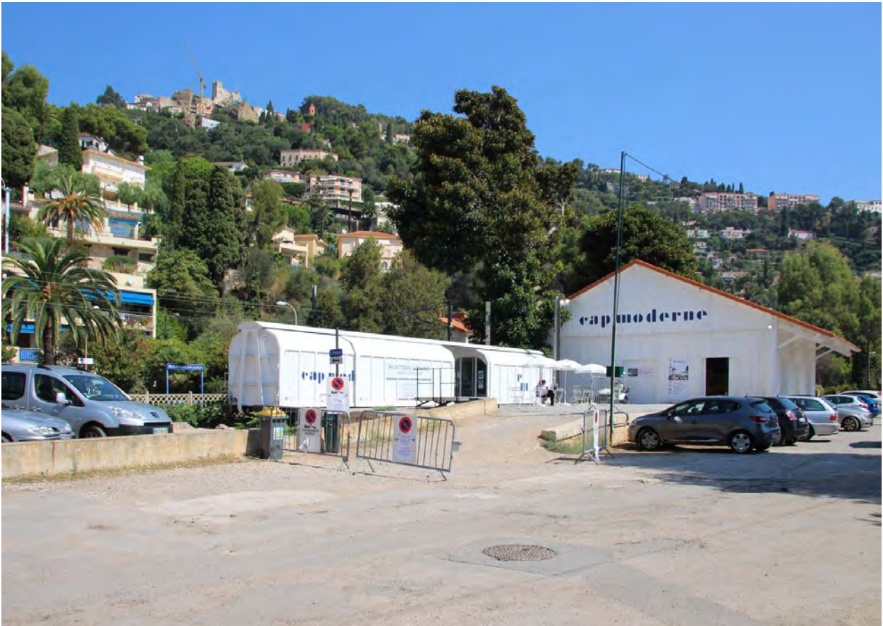
The train station of Roquebrune Cap Martin and the Reception Centre of Cap Moderne