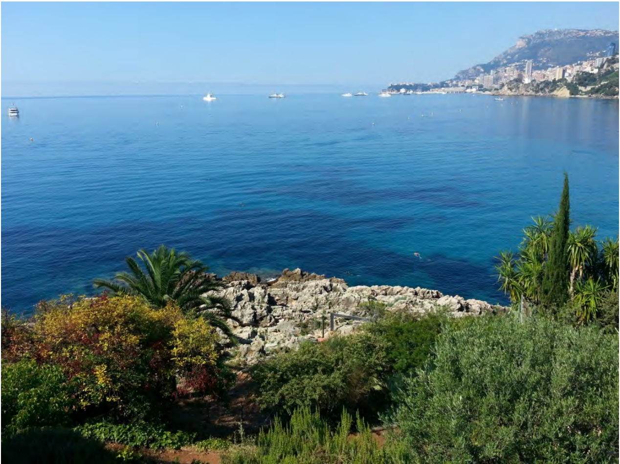
View of Roquebrune Cap Martin Bay