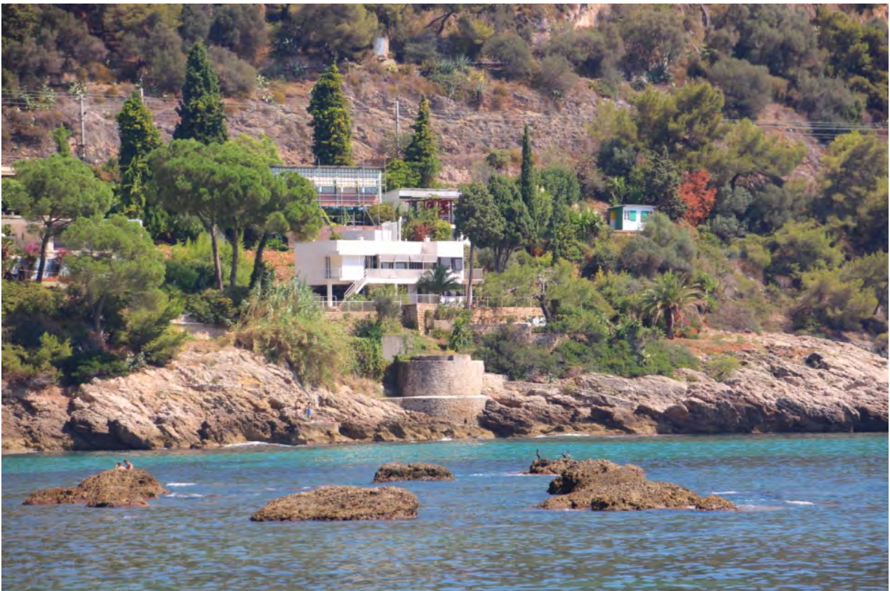
The site of E.1027, Unités e Camping and Cabanon